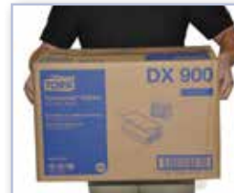
Use 2 hands for a comfortable grip.