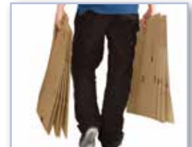
Fold box for easy disposal.