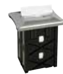
6035120 stainless finish