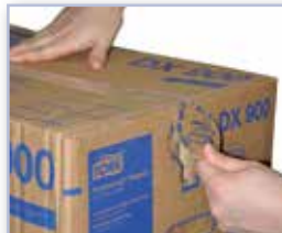
Boxes open quickly without cutting.