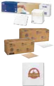
Ice Cream print