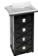
6035200 stainless finish