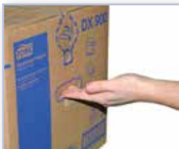
Easy to carry thanks to perforated fold-outs.

SCA offers Easy Handling packaging, a patented assortment of innovative and ergonomic solutions to ease the workload of facility staff while saving time and money. Easy Handling packaging includes the Tork Carry Box™ for our Tork Xpressnap napkins.