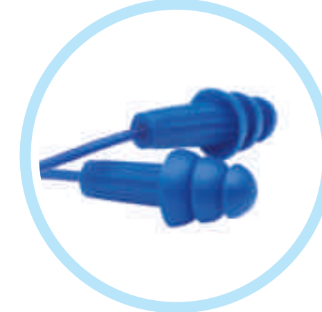
JACKSON SAFETY® H20 Metal Detectable Hearing Protection, Corded