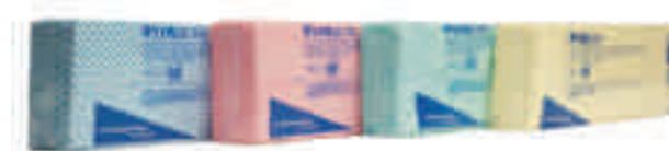
WYPALL® X80 Colour Coded Cloths