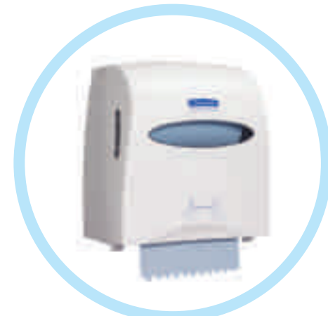
SCOTT® Slimroll Hand Towel and Dispenser

We offer an innovative range of electronic rolled Hand Towel and Skin Care dispensers which provide even higher levels of hygiene and lower cost in use.