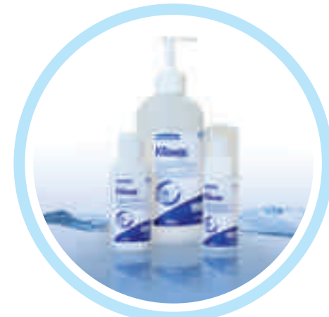
KLEENEX® Hand Sanitiser Range