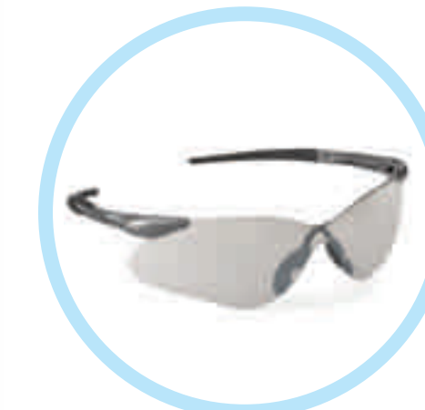
JACKSON SAFETY® V30 Nemesis VL Eye Wear, Clear